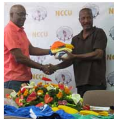
Handover of Uniforms to Pointe Michel Football Academy